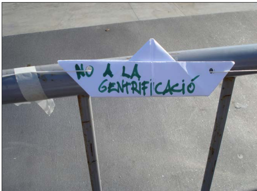
Photo 2 One element of a garland of paper boats with claims written on by neighbours and activists. On this boat is written 'No Gentrification'.

To sum up, it is not possible to identify either scholars or activists as the only knowledge producers. We must admit that there is a strong mutual influence of critical social sciences at play in the Port Vell issue and the protest movement's internal production of arguments, narratives and logical progressions. Terms and concepts used in the scientific community's engagement with Port Vell are adopted by the activists. At the same time, alternative arguments, claims and ideas are shaped by activists in internal discussions and are imported into the academic sphere – where they are written down in scientific articles (like this one). Through this exchange of information, science and activism amalgamate into a complex knowledge-making assemblage that sometimes renders it impossible to definitely trace back single effects to the former or the latter. The Port Vell example shows us that in the process of co-producing knowledge, scientific terms and ideas can become mobile. While oscillating between the areas of science and protest, they are not only transformed themselves, but they also transform both the protests and the scientific work and its results – a process that has also described the mobility of urban policies (McCann and Ward 2011).